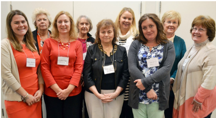
AKS Conference First Timers in Attendance (in alphabetical order)