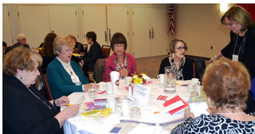
Chapter members at Zeta's reserved table

Congratulations to Zeta and Iota Chapters for bringing the most members per chapter to the Fall Conference! Zeta Chapter had seventeen members for the most chapter members in attendance. Iota Chapter had eight members, the second highest in attendance and the highest percentage of attendees. Spring Convention is coming in April. How about encouraging other chapter members to attend with you and helping your chapter gain a reserve table? There will also be a special surprise for first-time members attending a spring convention! Look for the check-off line on the bottom of the registration form.